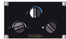
Recirculation Switch Fan Switch